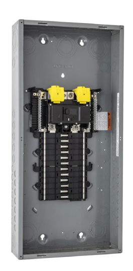
QO circuit breaker