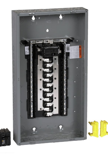
Homeline circuit breakers

Inspect load centers and circuit breakers