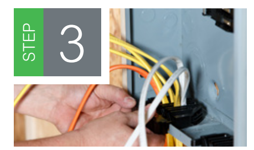
Snap on the Qwik-Grip shield when all circuits are installed